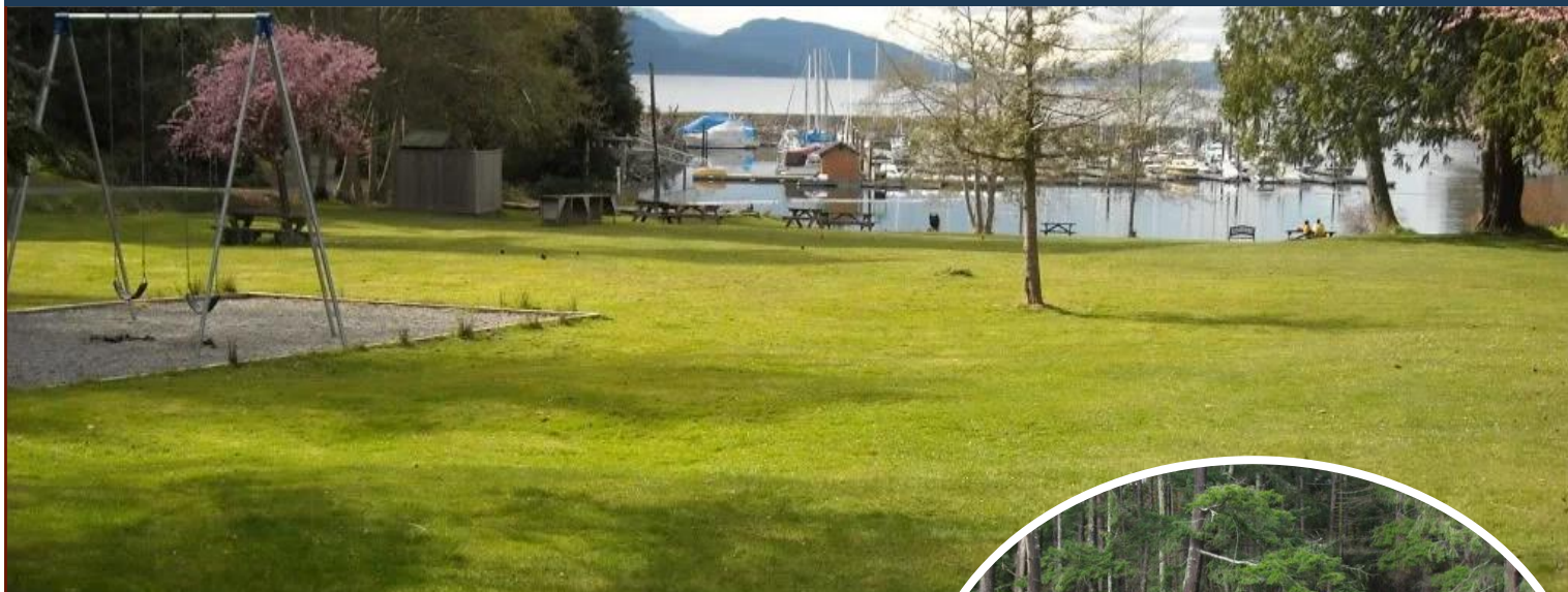
Thieves Bay Marina & Park