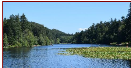
Steps to Magic Lake