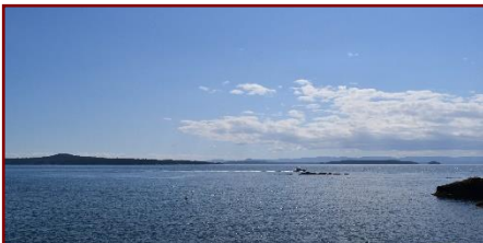
Boat Nook Nearby

Spacious family home on level, sunny corner lot features three bedrooms, three bathrooms, formal dining room, bright country kitchen and living room with cozy brick fireplace. Ground level offers a generous studio /workshop /rec room area with wood stove and extra storage. Excellent potential for in-law suite or home based business. Level yard is great for kids and pets. Property is serviced by municipal water and sewer and is located just across the street from Magic Lake; the perfect spot to launch your canoe or kayak. Age of dwelling and all room measurements are approximate - buyer to verify if important.