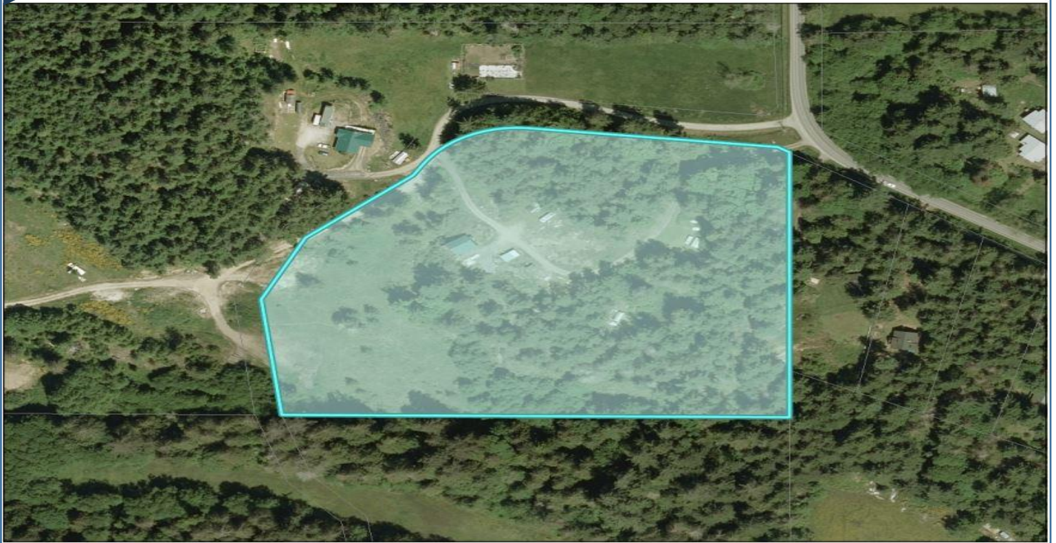
Aerial - 4511 Bedwell Harbour Rd