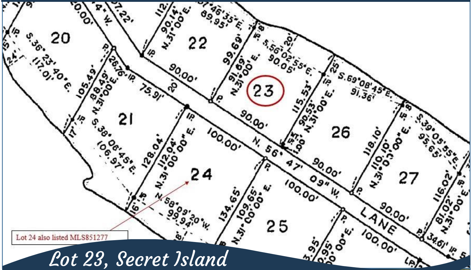
Lot 23, Secret Island