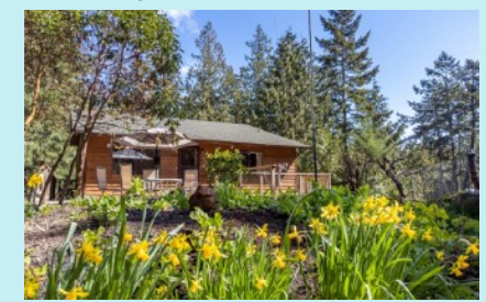
Peaceful Island Retreat