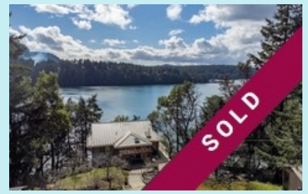
146 Winter Cove Rd