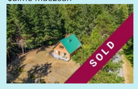
2602 Dory Way