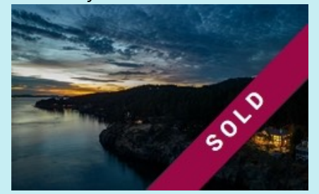
37187 Schooner Way