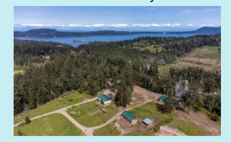
10 Acre Homestead