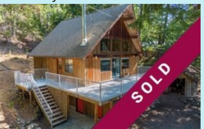
37160 Galleon Way