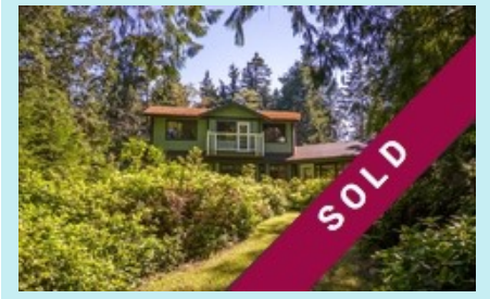
7901 Trincoma Pl