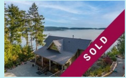
5579 Hooson Rd