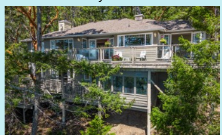
Nestled in National Park