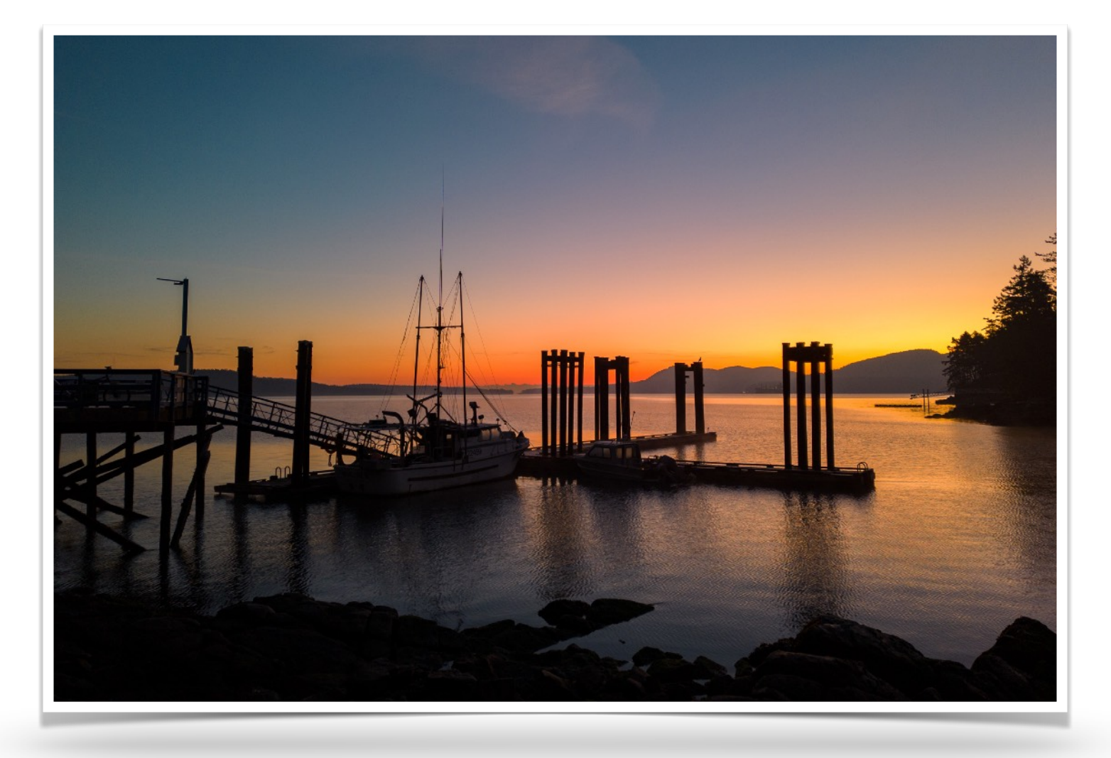
Sunrise at Hope Bay