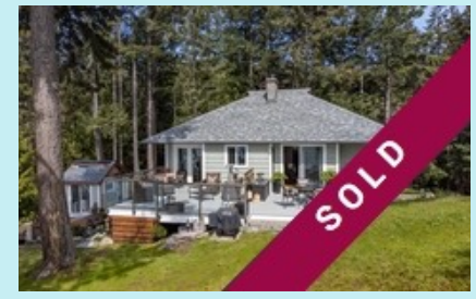
2705 Yawl Lane