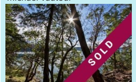
140 Winter Cove Rd