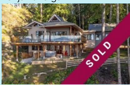
1604 Storm Cr