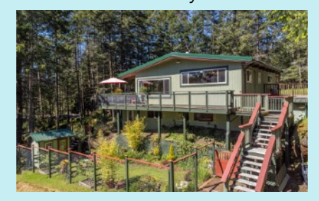
Sunny private island home