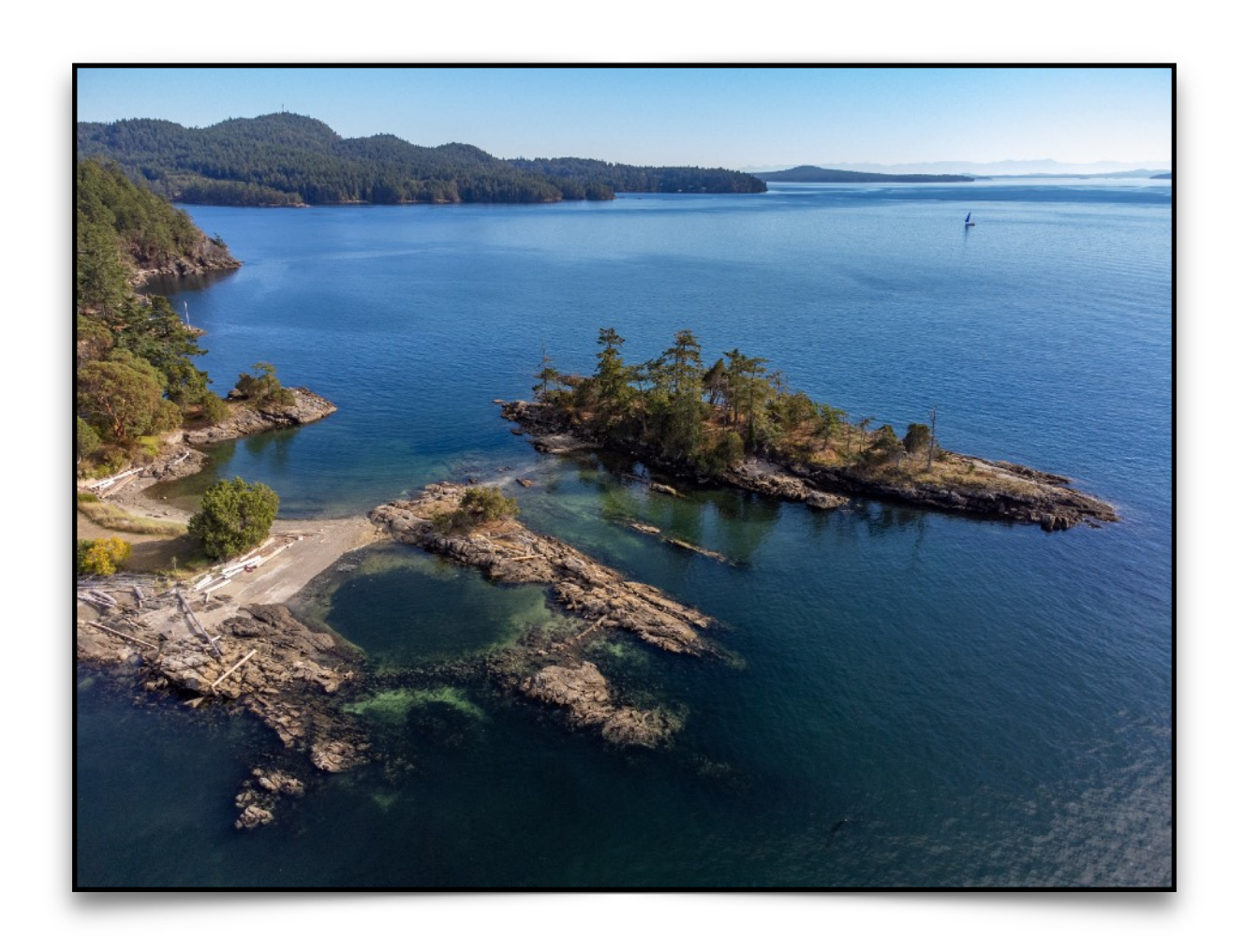
MacKinnon Beach - Pender Island