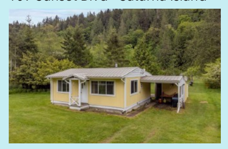
Charming two bedroom